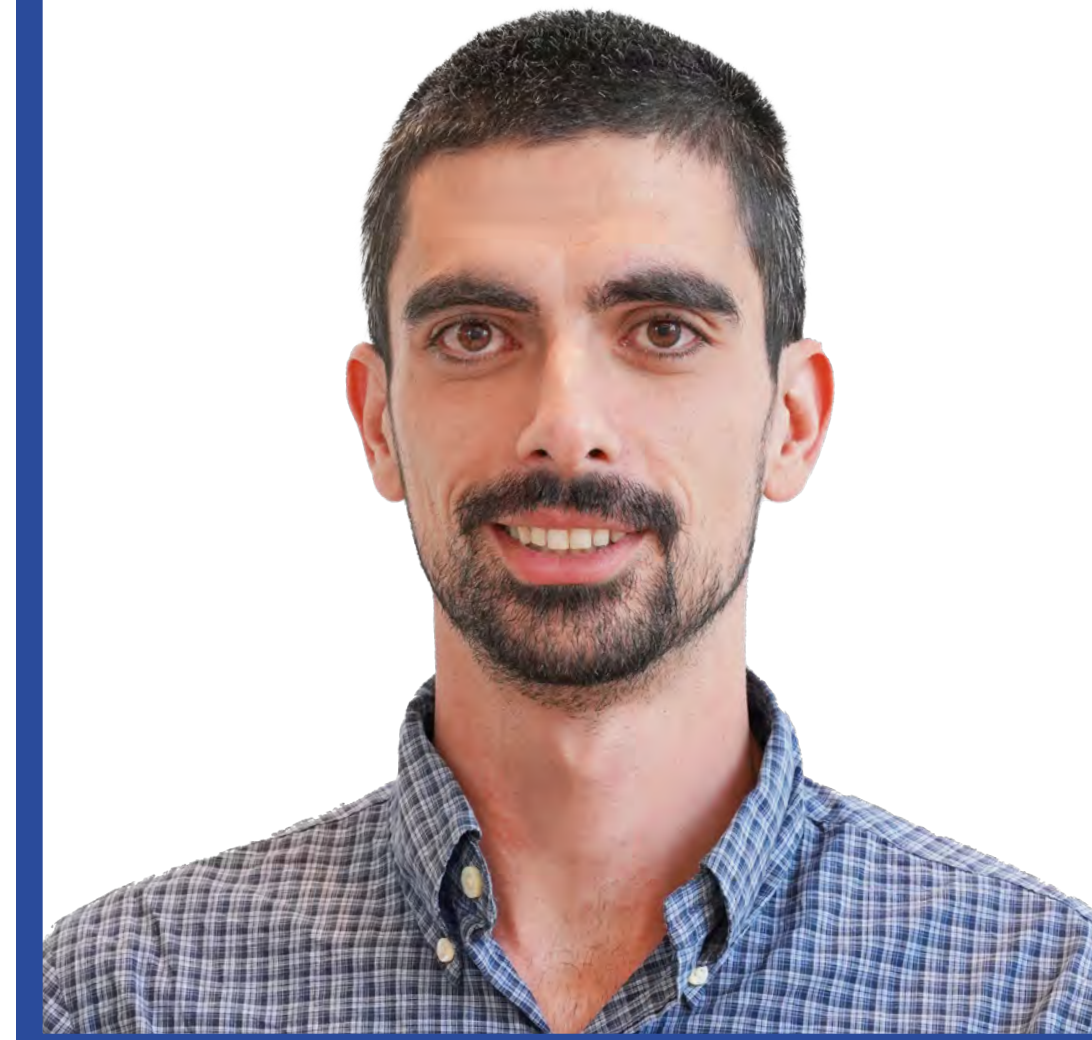
YOUSEF SROUJI CEO

$8 to $14 per respondent depending on the number and type of respondents.